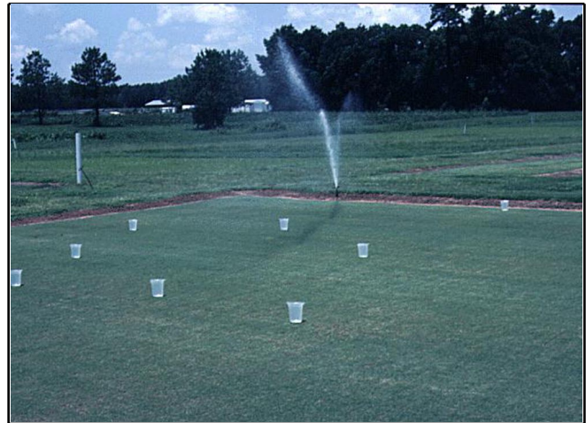
Figure 1. Calibrating a Sprinkler System